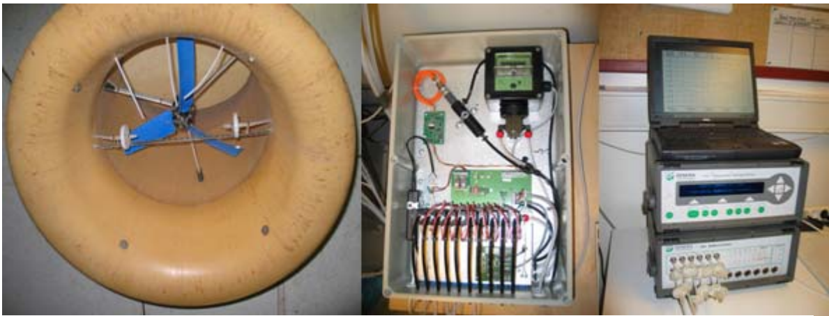
Figure 1 Test set-up of detection instruments for real time modelling of ammonia emission at the Climate Lab at Research Centre Bygholm

The monitoring system including the model will be installed in selected production units. The system and the collected data will be validated regarding detection accuracy, calibration