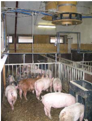
Figure 3: Slaughter pigs in Climate Lab at Byghom

after the change with batches before the change. But if a change take place during a production period it would be relevant to compare the ammonia emission before and after the change in the same production period. Changes in ammonia emission during the production period can either be related to planed actions as change in feed composition or to unforeseen incidences as change in animal manure behaviour.