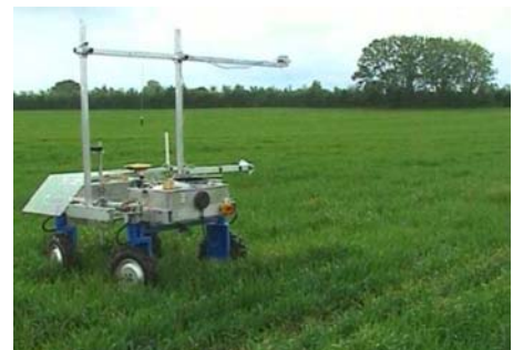
Figure: The API field robot platform

The implementation of precision farming principles requires several tasks to be solved; one of these is collecting site-specific information about the crop. Manual inspection of a field is laborious and it would be advantageous if the task could be automated. Such an automated inspection of crops could be based on photographic information. Images could be acquired at different scales from photo sensing systems placed at various distances, spanning from satellite-based down to ground-based systems. The ACROSS project concerns the use of ground-based systems for monitoring and analysis of crops. Field and plot trials are conducted using the API field robot platform.